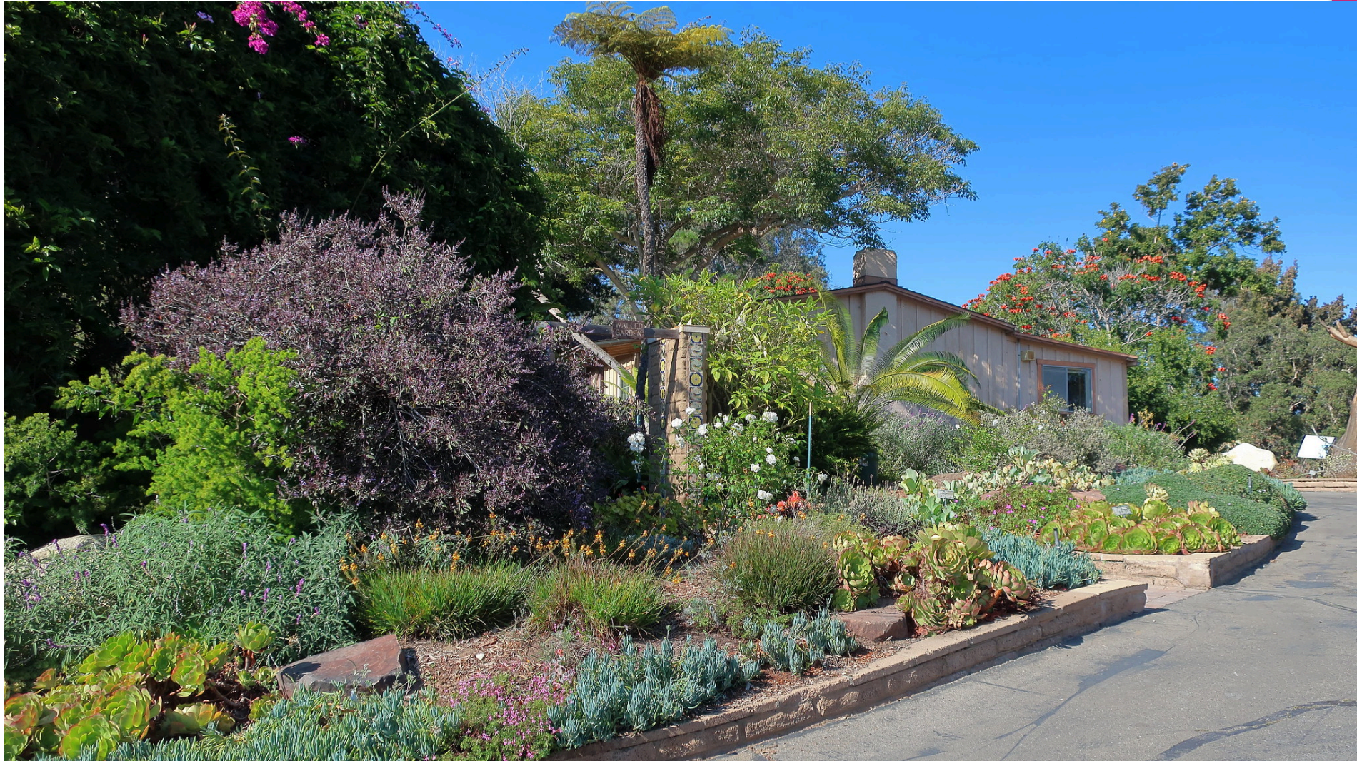
Arabian Lilac in a garden setting at the Larabee House San Diego Botanical Garden

https://www.flickr.com/photos/131880272@N06/48650450878