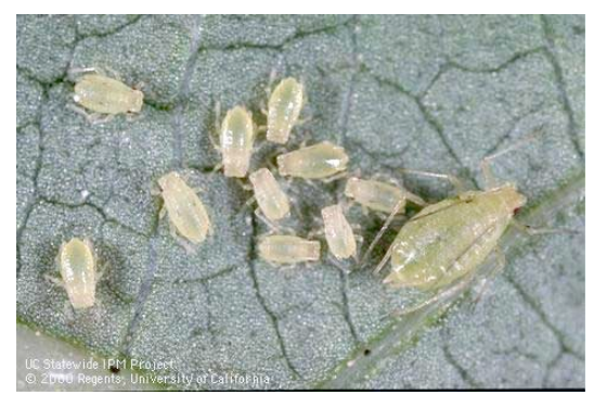
Green Peach Aphid