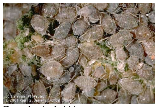
Rosy Apple Aphid