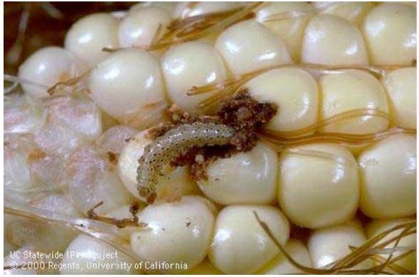
Corn earworm larva feeding on corn