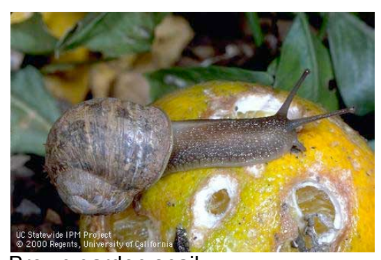
Brown garden snail

Snails and slugs are among the most bothersome pests in many garden and landscape situations. On plants they chew irregular holes with smooth edges in leaves and flowers and can clip succulent plant parts. They can also chew fruit and young plant bark. Because they prefer succulent foliage or flowers, they are primarily pests of seedlings and herbaceous plants, but they are also serious pests of ripening fruits, such as strawberries, artichokes, and tomatoes, that are close to the ground.