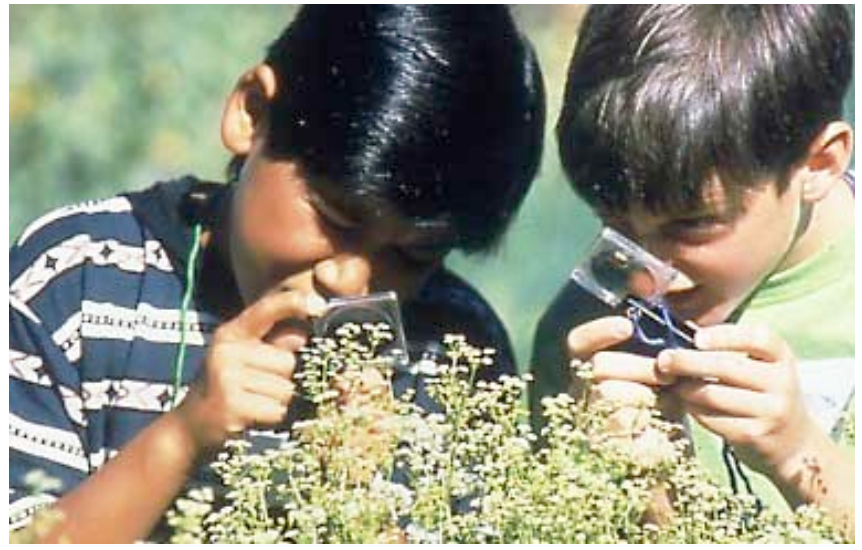
Examine the plants at least once or twice a week during the growing season

The most important step of IPM is going out to the garden on a regular basis and systematically checking the plants for pests and symptoms of damage.