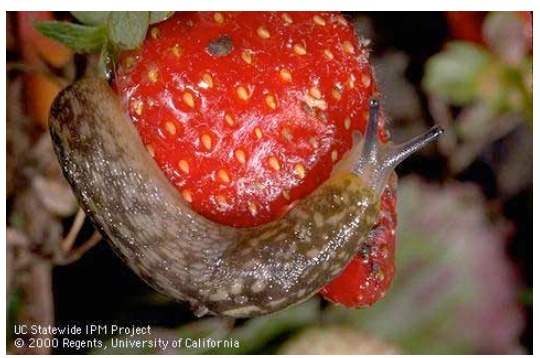
Slug crawling on ripe strawberry