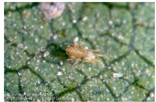
Adult Pacific Spider Mite

Spider mites are the most common mite pest in the garden. To the naked eye, spider mites look like tiny moving dots; however, you can see them easily with a 10X hand lens. Adult females, the largest forms, are less than 1/20 inch long. Spider mites live in colonies, mostly on the under-surfaces of leaves; a single colony may contain hundreds of individuals. The names "spider mite" and "webspinning mite" come from the silk webbing species produce on infested leaves. The presence of webbing is an easy way to distinguish them from all other types of mites.