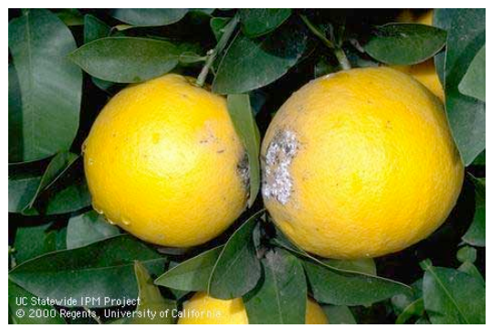
Crop damaged by citrus mealybug