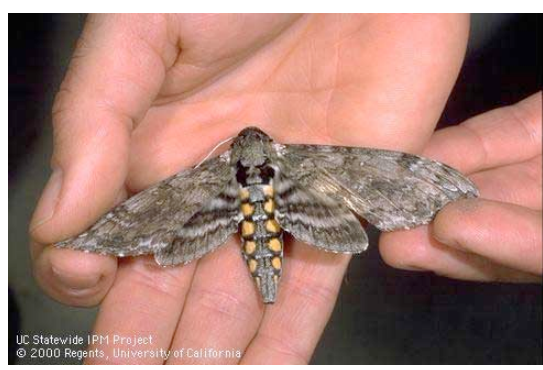
Adult tomato hornworm