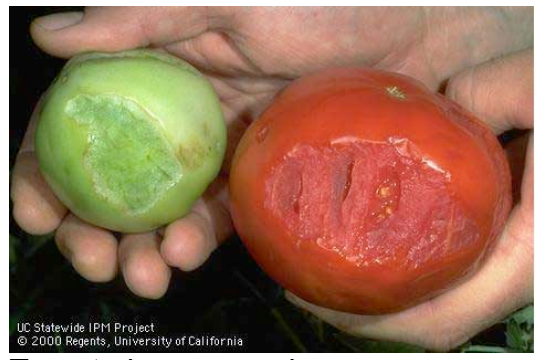
Tomato hornworm damage