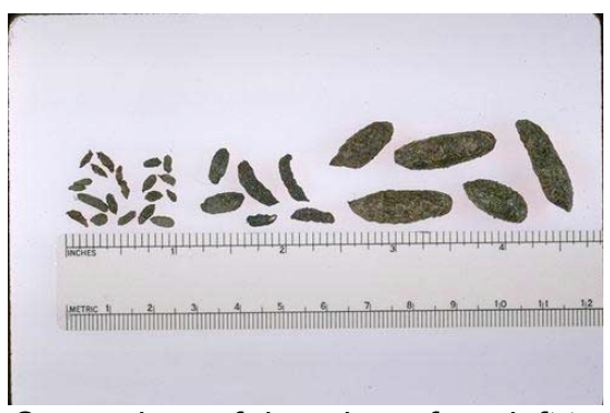
Comparison of droppings, from left to right are house mouse, roof rat, and Norway rat.