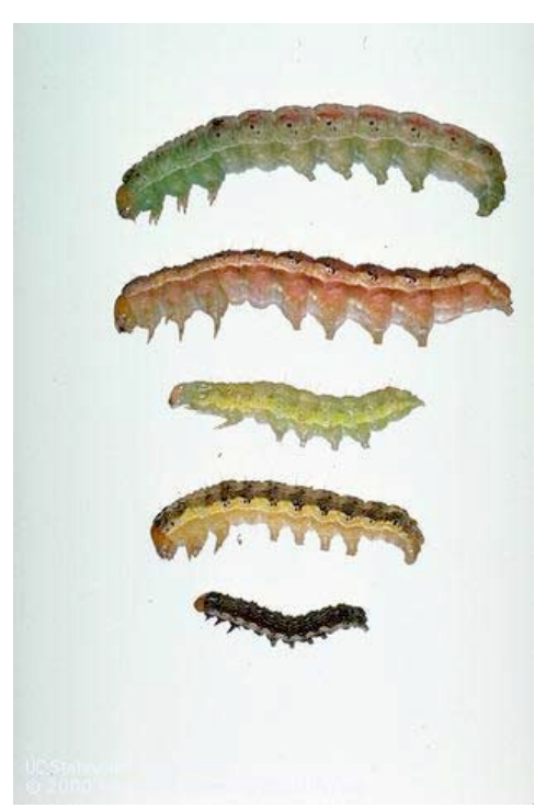
Color variations of tomato fruit worm (also called corn earworm and cotton bollworm).

The corn earworm may be present throughout the season but is most abundant during August and September. Larvae feed on leaves, tassels, the whorl, and within ears, but the ears are the preferred sites for corn earworm attack.