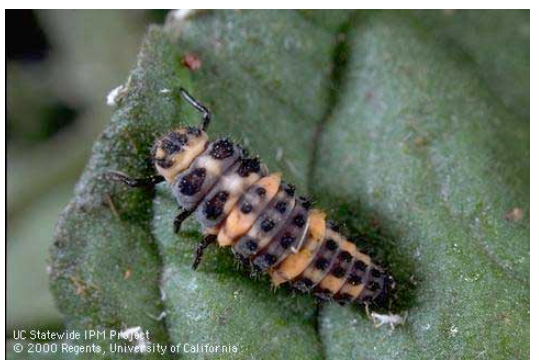
Larva of convergent lady beetle