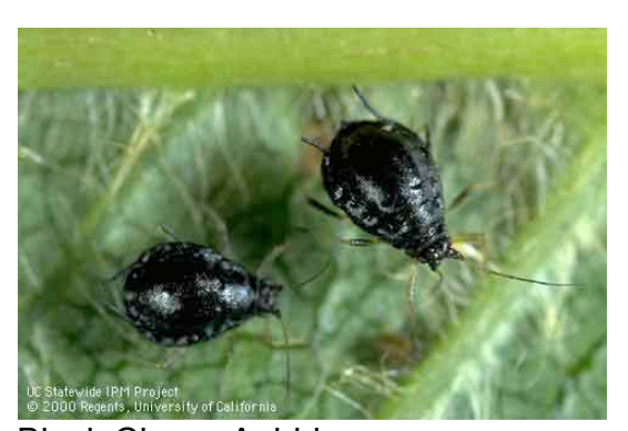
Black Cherry Aphid

Aphids are small, soft-bodied insects with long, slender mouth parts that they use to pierce stems, leaves, and other tender plant parts and suck out plant fluids. Almost every plant has one or more aphid species that occasionally feeds on it. Large populations cause curling, yellowing, and distortion of leaves and stunting shoots; they can also produce large quantities of a sticky exudate known as honeydew, which often turns black with the growth of a sooty mold fungus. Aphids come in a variety of colors.