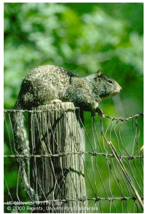
California Ground Squirrel