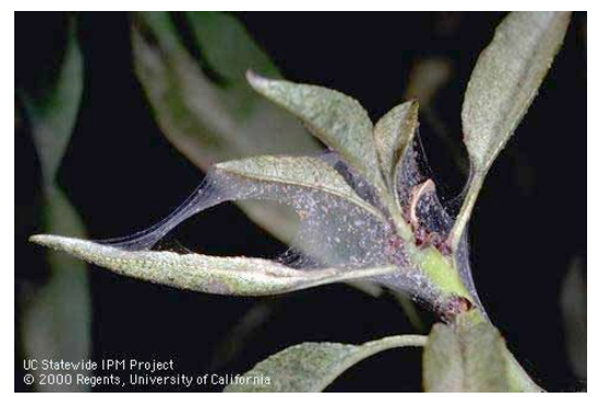
Leaf mottling and webbing from heavy infestation of spider mites