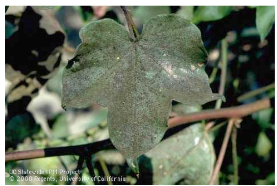
Sooty mold grows over honeydew left by a whitefly infestation on cotton