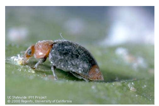
Adult mealybug destroyer

Both adults and larvae feed on exposed mealybug species and other homopterans such as the green shield scale. C. montrouzieri are most effective at controlling mealybugs when the mealybug population is high.