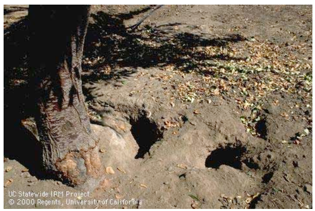
California Ground Squirrel burrows