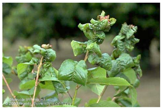
Leaf curling and distortion caused by aphids