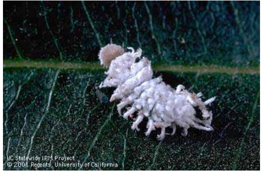
Mealybug destroyer larva feeding on citrus mealybug