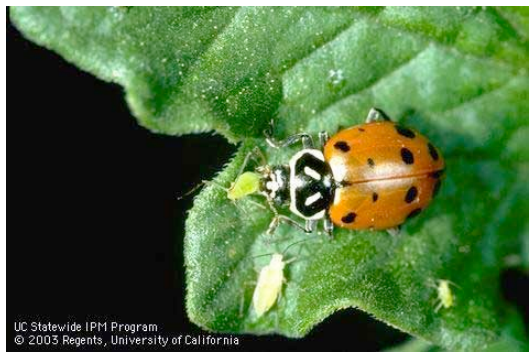
Adult convergent lady beetle feeding on aphids

Both adults and larvae of lady beetles feed primarily on aphids and occasionally on whiteflies, other soft-bodied insects, and insect eggs.