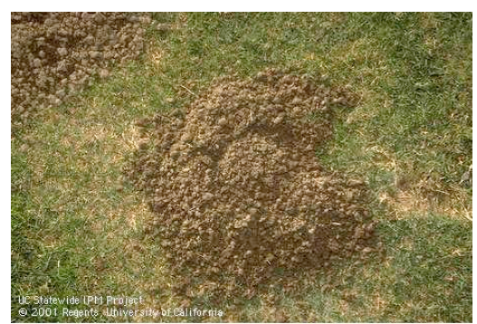
Characteristic crescent-shaped mound and plugged burrow opening of a pocket gopher