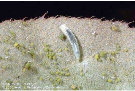
Syrphid fly larva preying on aphids