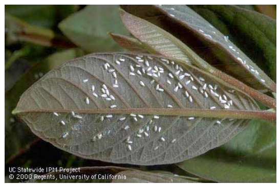
Adult greenhouse whiteflies and tiny eggs